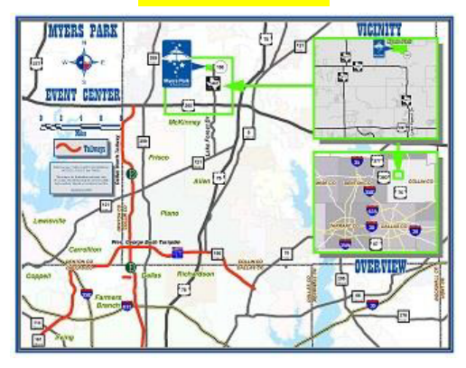
Myers Park and Event Center (MPEC)

McKinney is located approximately 33 miles north and east of downtown Dallas via U.S. Highway 75 (North Central Expressway). From U.S. Highway 75, take the Highway 380 Exit (Exit 41), and head WEST approximately 2.5 miles until you reach FM 1461. Turn right/North on FM1461 and travel approximately 3.8 miles to County Road 166. Turn right/North on County Road 166 Go about a mile. You will see the MPEC on your left. Do not turn in. Continue until you reach the stop sign at County Rd 168. Turn left/West onto County Road 168.